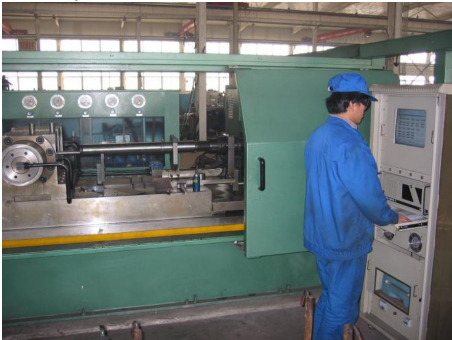
Numerical control machine: