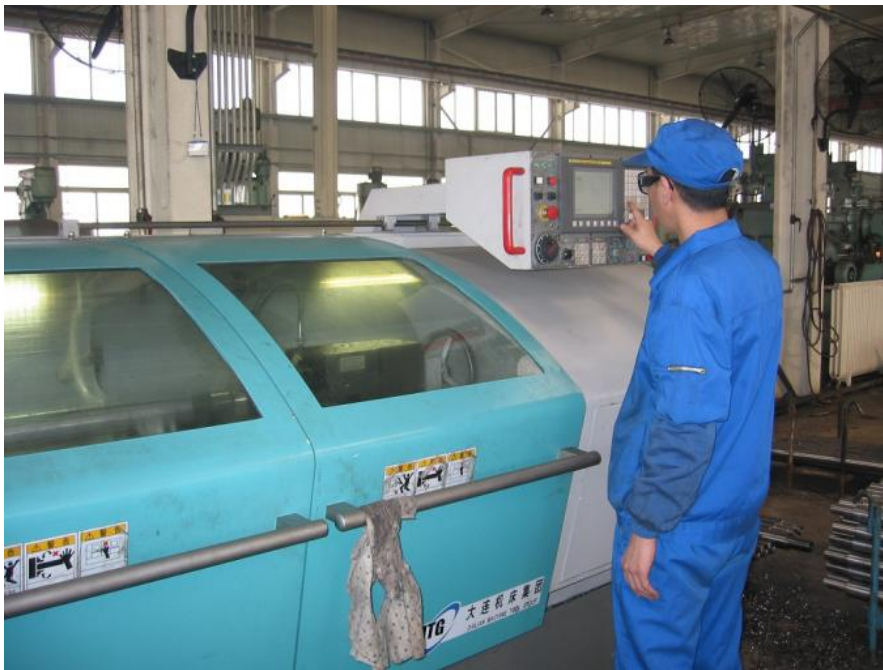
Ring seam welding machine: