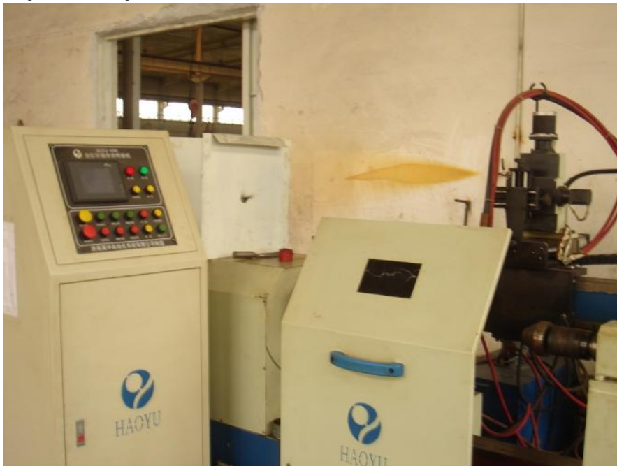
Automation nozzle welding machine: