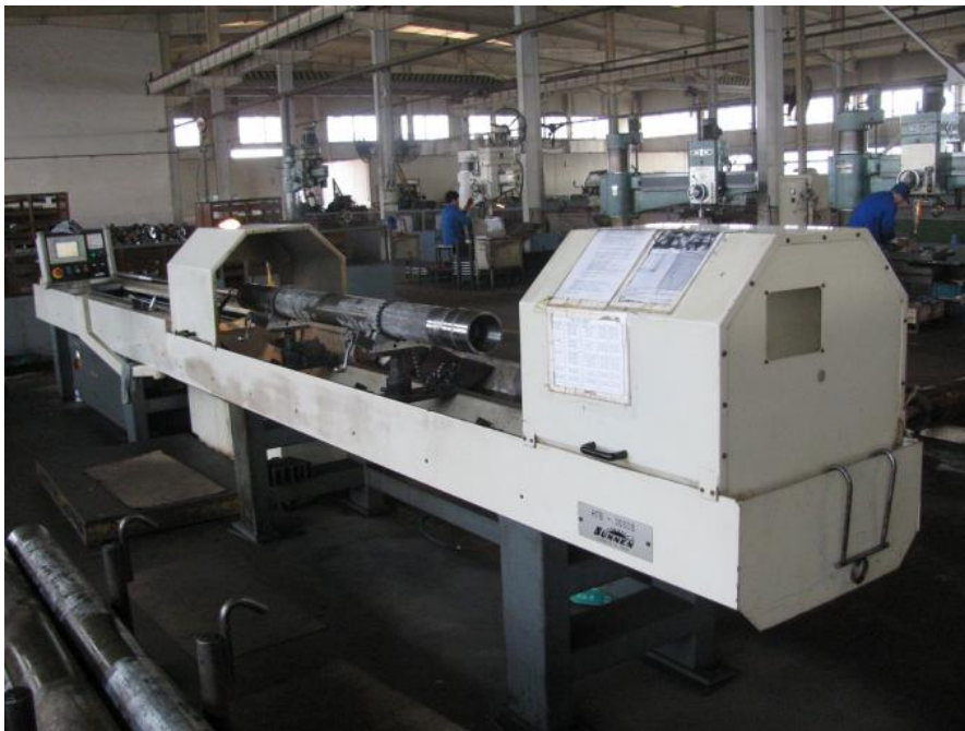
Boring and extrusion machine: